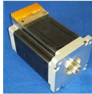
X86-118 with gear

Type I to see information and the current motion profile. Type G to run the stepper motor. Change direction ( C or W ), V sps, or number of steps N , type G , and see the difference. Type ? To display a brief command help. It's that simple. You can use inputs for Input Profile, do auto-Home, or run CNC/gcode modes for extra motion control. Global Controller values are changed in the c menu.