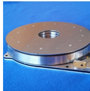
MRT8-42-153 Rotary Table