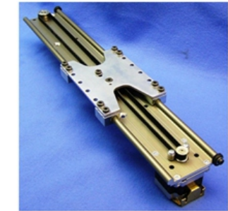
BS80 Belt Slider